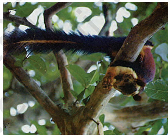
Fig. 7.3 (b) : Giant squirrel

endemic flora of the Pachmarhi Biosphere Reserve. Bison, Indian giant squirrel [Fig. 7.3 (b)] and flying squirrel are endemic fauna of this area. Professor Ahmad explains that the destruction of their habitat, increasing population and introduction of new species may affect the natural habitat of endemic species and endanger their existence.