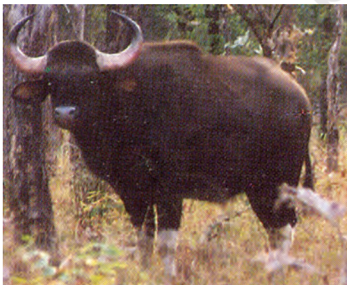
Fig. 7.5 : Wild buffalo

buffaloes (Fig. 7.5) and barasingha (Fig. 7.6) were also found in the Satpura National Park. Animals whose numbers are diminishing to a level that they might face extinction are known as the endangered animals . Boojho is reminded of the dinosaurs which became extinct a long time ago. Survival of some