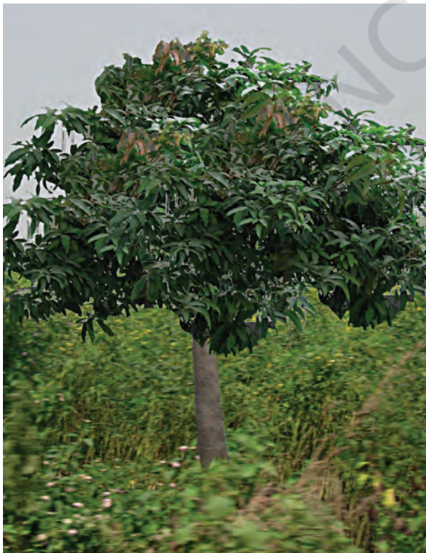
Fig. 7.3 (a) : Wild Mango

Madhavji shows sal and wild mango (Fig. 7.3 (a)) as two examples of the