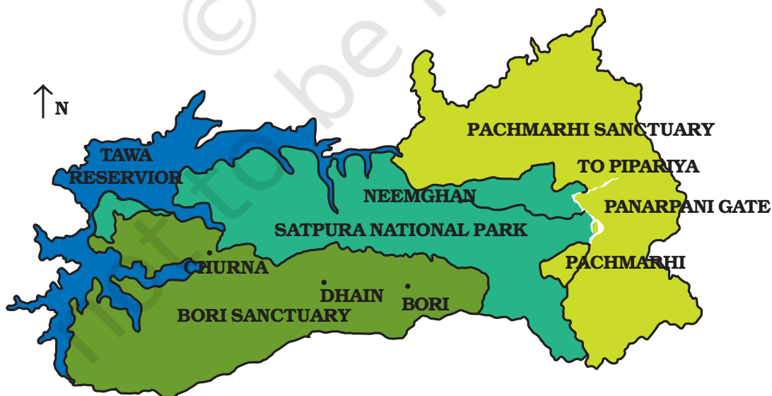
Fig. 7.1 : Pachmarhi Biosphere Reserve