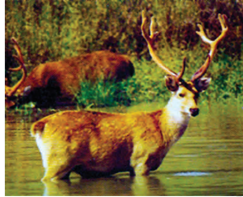
Fig. 7.6 : Barasingha

animals has become difficult because of disturbances in their natural habitat. Professor Ahmad tells them that in order to protect plants and animals strict rules are imposed in all National Parks. Human activities such as grazing, poaching, hunting, capturing of animals or collection of firewood, medicinal plants, etc. are not allowed