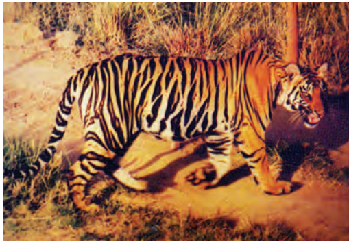
Fig. 7.4 : Tiger

Tiger (Fig. 7.4) is one of the many species which are slowly disappearing from our forests. But, the Satpura Tiger Reserve is unique in the sense that a significant increase in the population of tigers has been seen here. Once upon a time, animals like lions, elephants, wild