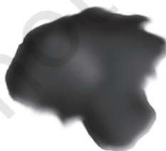
Fig. 5.3: Coal tar

It is a black, thick liquid (Fig. 5.3) with an unpleasant smell. It is a mixture of