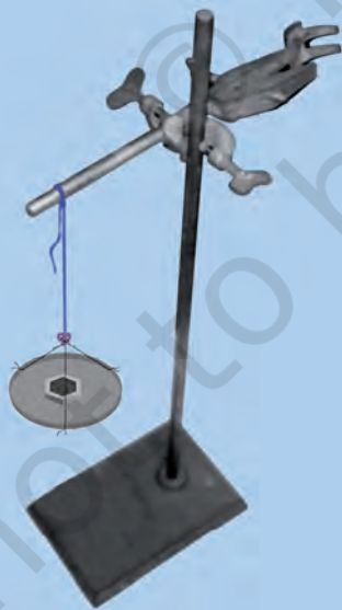
Fig. 3.5: An iron stand with a thread hanging from the clamp

Take an iron stand with a clamp. Take a cotton thread of about 60 cm length. Tie it to the clamp so that it hangs freely from it as shown in Fig. 3.5. At the free end suspend