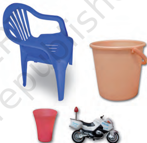
Fig. 3.7 : Various articles made of plastics

Plastic is also a polymer like the synthetic fibre. All plastics do not have the same type of arrangement of units. In some it is linear, whereas in others it is cross-linked. (Fig. 3.6). Plastic articles are available in all possible shapes and sizes as you can see in Fig. 3.7. Have you ever wondered how this is possible? The fact is that plastic is easily mouldable i.e. can be shaped in any form. Plastic can be recycled, reused, coloured, melted, rolled into sheets or made into wires. That is why it finds such a variety of uses.