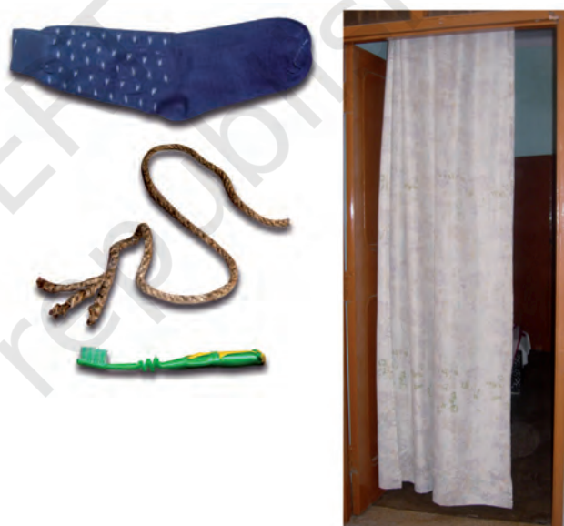
Fig. 3.3: Various articles made from nylon

We use many articles made from nylon, such as socks, ropes, tents, toothbrushes, car seat belts, sleeping bags, curtains, etc. (Fig. 3.3). Nylon is