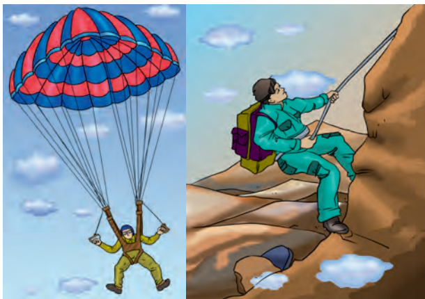
Fig. 3.4: Use of nylon Fibres

also used for making parachutes and ropes for rock climbing (Fig. 3.4). A nylon thread is actually stronger than a steel wire.