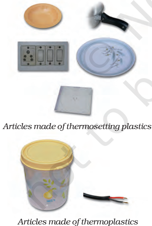
Fig. 3.8 : Some articles made of plastic

On the other hand, there are some plastics which when moulded once, can not be softened by heating. These are called thermosetting plastics . Two examples are bakelite and melamine. Bakelite is a poor conductor of heat and electricity. It is used for making electrical switches, handles of various utensils, etc. Melamine is a versatile material. It resists fire and can tolerate heat better than other plastics. It is used for making floor tiles, kitchenware and fabrics which resist fire. Fig. 3.8 shows the various uses of thermoplastics and thermosetting plastics.