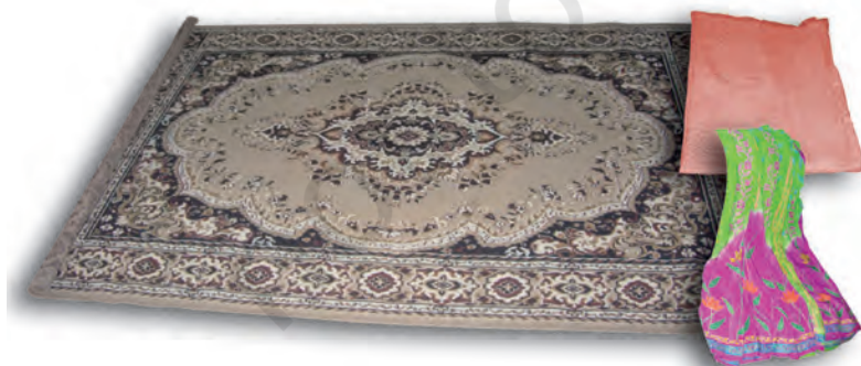
Fig. 3.2 : Articles made of rayon

You have read in Class VII that silk fibre obtained from silkworm was discovered in China and was kept as a closely guarded secret for a long time. Fabric obtained from silk fibre was very costly. But its beautiful texture fascinated everybody. Attempts were made to make silk artificially. Towards the end of the nineteenth century, scientists were successful in obtaining a fibre having properties similar to that of silk. Such a fibre was obtained by chemical treatment of wood pulp. This fibre was called rayon or artificial silk . Although rayon is obtained from a natural source, wood pulp, yet it is a man-made fibre. It is cheaper than silk and can be woven like silk fibres. It can also be dyed in a wide variety of colours. Rayon is mixed with cotton to make bed sheets or mixed with wool to make carpets. (Fig. 3.2.)