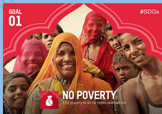
Sustainable Development Goal (SDG) www.in.undp.org

What do you think is meant by the expression 'power over the ballot box'? Discuss.