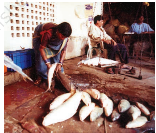
Top: Members of the TMS protesting at a rally. Above: A member of the cooperative weighing the fish.

With the TMS taking over the fishworkers were able to increase their earnings substantially. This was because they set up the cooperative which would buy the catch from them at a fair price. The cooperative would then arrange to transport and sell this in markets where they would get a good price. They have now begun to earn three times more than they earned earlier. The TMS has also begun giving the fishworkers loans for repair and the buying of new nets. By managing to earn a higher wage as well as preserving the fish in the reservoir, the TMS has shown that when people's organisations get their rights to livelihood, they can be good managers.