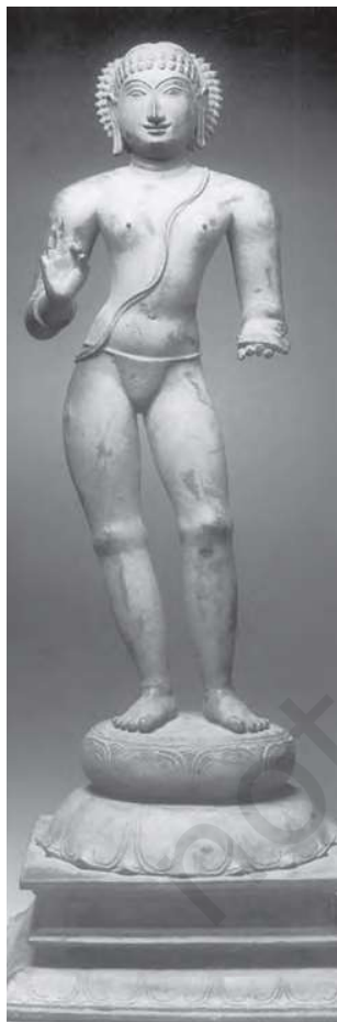
Fig. 2 A bronze image of Manikkavasagar.