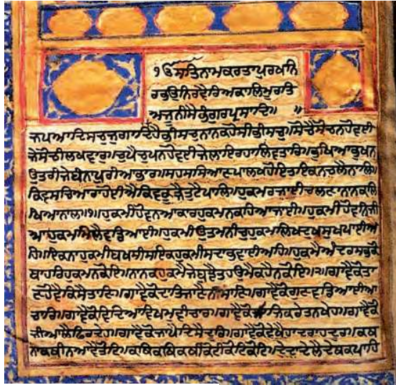
Fig. 11 An early manuscript of the Guru Granth Sahib.

a new script known as Gurmukhi. The three successors of Guru Angad also wrote under the name of “Nanak” and all of their compositions were compiled by Guru Arjan in 1604. To this compilation were added the writings of other figures like Shaikh Farid, Sant Kabir, Bhagat Namdev and Guru Tegh Bahadur. In 1706 this compilation was authenticated by Guru Tegh Bahadur’s son and successor, Guru Gobind Singh. It is now known as Guru Granth Sahib , the holy scripture of the Sikhs.