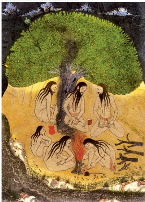
Fig. 3 A fireside gathering of ascetics.

A number of religious groups that emerged during this period criticised the ritual and other aspects of conventional religion and the social order, using simple, logical arguments. Among them were the Nathpanthis, Siddhacharas and Yogis. They advocated renunciation of the world. To them the path to salvation lay in meditation on the formless Ultimate Reality and the realisation of oneness with it. To achieve this they advocated intense training of the mind and body through practices like yogasanas , breathing exercises and meditation. These groups became particularly popular among “low” castes. Their criticism of conventional religion created the ground for devotional religion to become a popular force in northern India.