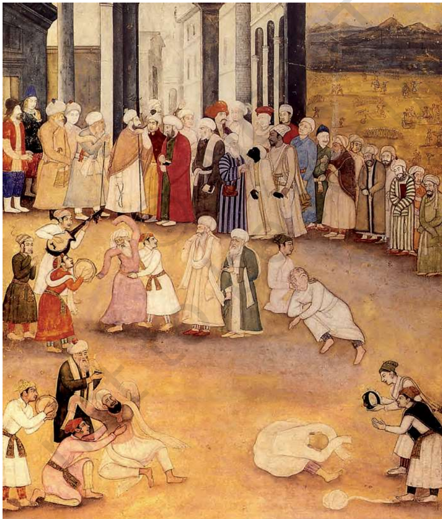
Fig. 4 Mystics in ecstasy.

disregard for the world. Like the saint-poets, the Sufis too composed poems expressing their feelings, and a rich literature in prose, including anecdotes and fables, developed around them. Among the great Sufis of Central Asia were Ghazzali, Rumi and Sadi. Like the Nathpanthis, Siddhas and Yogis, the Sufis too believed that the heart can be trained to look at the world in a different way. They developed elaborate methods of training using zikr (chanting of a name or sacred formula), contemplation, sama (singing), raqs (dancing), discussion of parables, breath control, etc. under the guidance of a master or pir . Thus emerged the silsilas , a spiritual genealogy of Sufi teachers, each following a slightly different method ( tariqa ) of instruction and ritual practice.