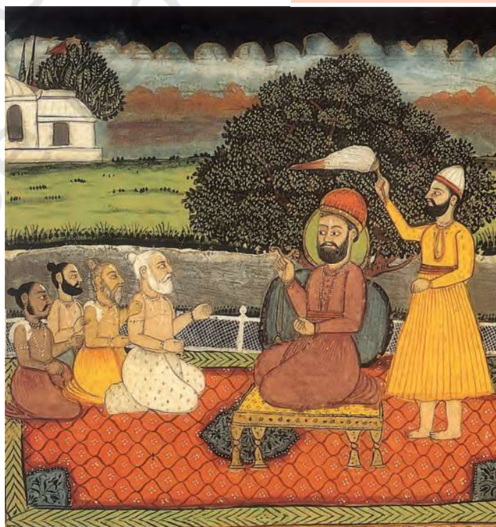
Fig. 10 Baba Guru Nanak as a young man, in discussion with holy men.

Before his death in 1539, Baba Guru Nanak appointed one of his followers as his successor. His name was Lehna but he came to be known as Guru Angad, signifying that he was a part of Baba Guru Nanak himself. Guru Angad compiled the compositions of Baba Guru Nanak, to which he added his own in