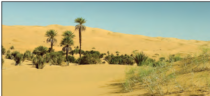
Fig. 9.3: Oasis in the Sahara Desert

snakes and lizards are the prominent animal species living there.