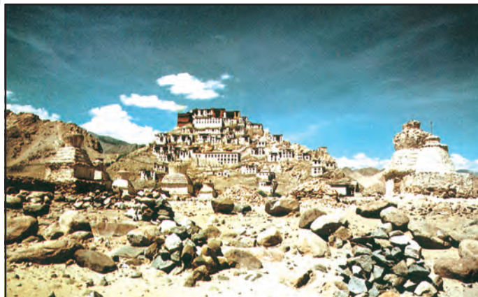
Fig. 9.5: Thiksey Monastery

The finest cricket bats are made from the wood of the willow trees.