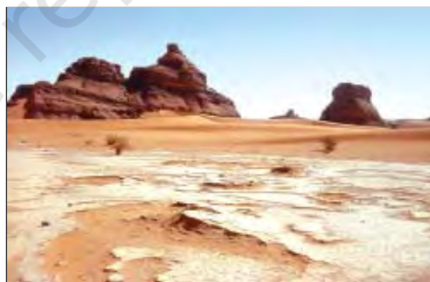
Fig. 9.1: The Sahara Desert

Look at the map of the world and the continent of Africa. Locate the Sahara desert covering a large part of North Africa. It is the world's largest desert. It has an area of around 8.54 million sq. km. Do you recall that India has an area of 3.28 million sq. km? The Sahara desert touches eleven countries. These are Algeria, Chad, Egypt, Libya, Mali, Mauritania, Morocco, Niger, Sudan, Tunisia and Western Sahara.