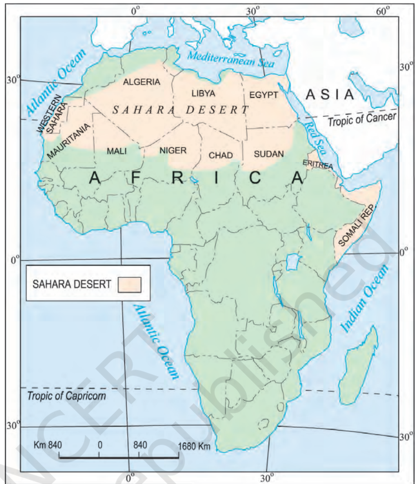
Fig. 9.2: Sahara in Africa

You will be surprised to know that present day Sahara once used to be a lush green plain. Cave paintings in Sahara desert show that there used to be rivers with crocodiles. Elephants, lions, giraffes, ostriches, sheep, cattle and goats were common animals. But the change in climate has changed it to a very hot and dry region.