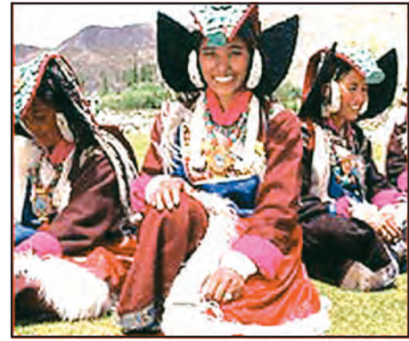
Fig. 9.6: Ladakhi Women in Traditional Dress

Life of people is undergoing change due to modernisation. But the people of Ladakh have over the centuries learned to live in balance and harmony with nature. Due to scarcity of resources like water and fuel, they are used with reverence and care. Nothing is discarded or wasted.