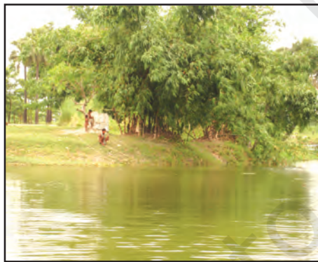
A clean lake

Binod is a fisherman living in the Matwali Maun village of Bihar. He is a happy man today. With the efforts of the fellow fishermen – Ravindar, Kishore, Rajiv and others, he cleaned the maun or the ox-bow lake to cultivate different varieties of fish. The local weed (vallisneria, hydrilla) that grows in the lake is the food of the fish. The land around the lake is fertile. He sows crops such as paddy, maize and pulses in these fields. The buffalo is used to plough the land. The community is satisfied. There is enough fish catch from the river – enough fish to eat and enough fish