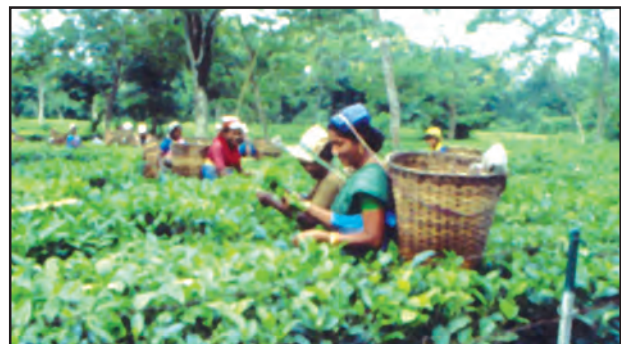
Fig. 8.10 : Tea Garden in Assam