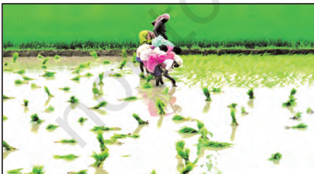
Fig. 8.9 : Paddy Cultivation

The vegetation cover of the area varies according to the type of landforms. In the Ganga and Brahmaputra plain tropical deciduous trees grow, along with teak, sal and peepal. Thick bamboo groves are common in the Brahmaputra plain. The delta area is covered with the