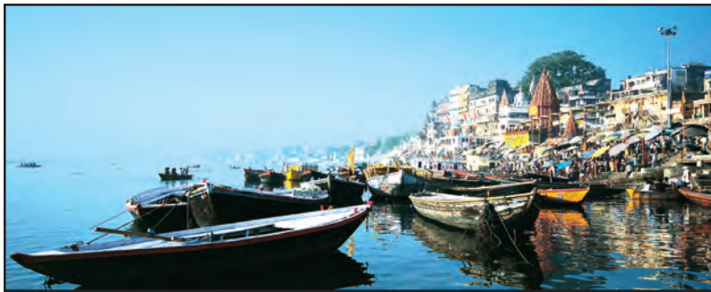
Fig. 8.13: Varanasi along the River Ganga

The Ganga-Brahmaputra plain has several big towns and cities. The cities of Allahabad, Kanpur, Varanasi, Lucknow, Patna and Kolkata all with the population of more than ten lakhs are located along the River Ganga (Fig. 8.13). The wastewater from these towns