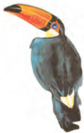
Fig. 8.4 : Toucans

The rainforest is rich in fauna. Birds such as toucans (Fig. 8.4), humming birds, macaw with their brilliantly coloured plumage, oversized bills for eating make them different from birds we commonly see in India. These birds also make loud sounds in the forests. Animals like monkeys, sloth and ant-eating tapirs are found here (Fig. 8.5). Various species of reptiles and snakes also thrive in these jungles. Crocodiles, snakes, pythons abound. Anaconda and boa constrictor are some of the species. Besides, the basin is home to thousands of species of insects. Several species of fishes including the flesh-eating Piranha fish is also found in the river. This basin is thus extraordinarily rich in the variety of life found there.