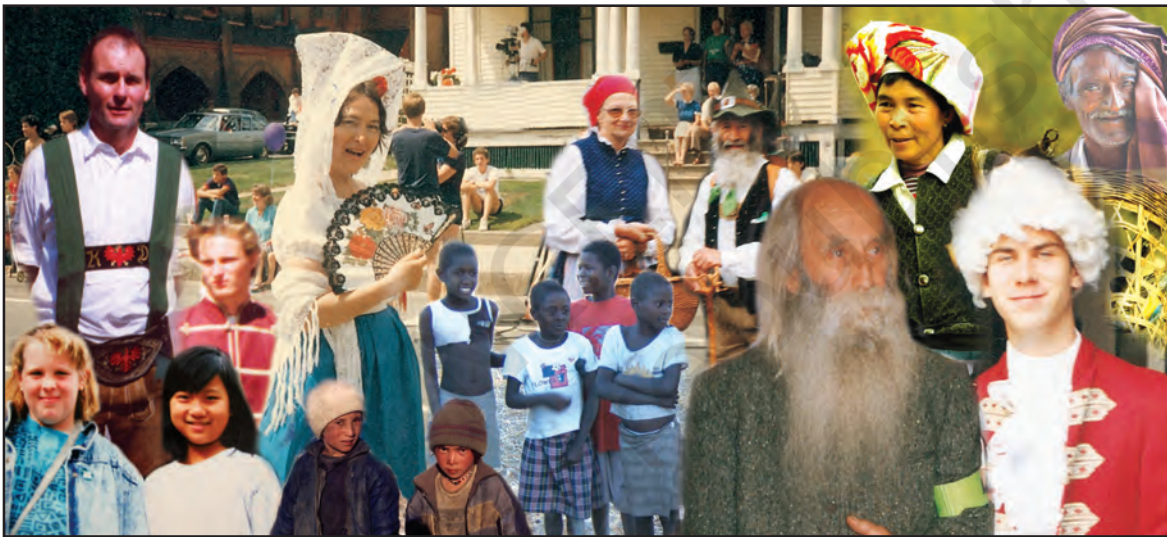
Fig. 8.1: People from various parts of the world

Renuka was excited. Shrikant Uncle was home after a gap of nearly four months. He was a wildlife photographer and travelled widely. Renuka's interest in wildlife and forests began at an early age, when her uncle introduced her to books on nature. Pictures of distant lands and people, who lived there, always fascinated her.