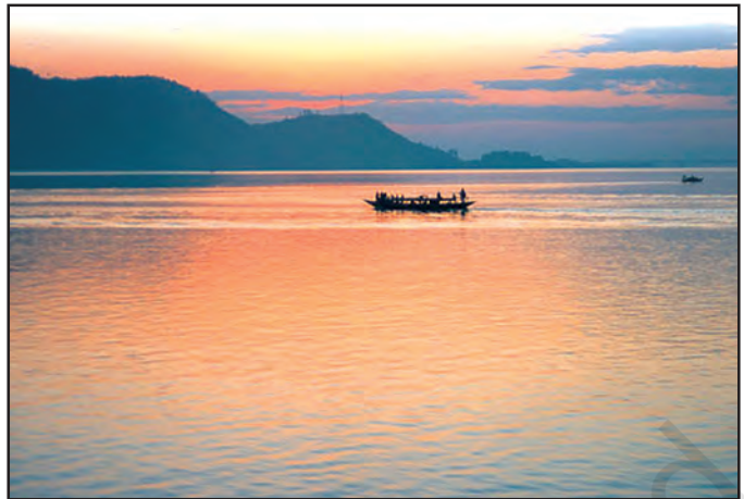
Fig. 8.7 Brahmaputra river

The tributaries of rivers Ganga and Brahmaputra together form the Ganga-Brahmaputra basin in the Indian subcontinent (Fig. 8.8). The basin lies in the sub-tropical region that is situated between 10°N to 30°N latitudes. The tributaries of the River Ganga like the Ghaghra, the Son, the Chambal, the Gandak, the Kosi and the tributaries of Brahmaputra drain it. Look at the atlas and find names of some tributaries of the River Brahmaputra.