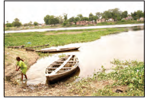
A Polluted Lake

to sell in the market. They have even begun supply to the neighbouring town. The community is living in harmony with nature. As long as the pollutants from nearby towns do not find their way into the lake waters, the fish cultivation will not face any threat.