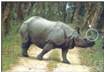
Fig. 8.11 : One horned rhinoceros

There is a variety of wildlife in the basin. Elephants, tigers, deer and monkeys are common. The one-horned rhinoceros is found in the Brahmaputra plain. In the delta area, Bengal tiger and crocodiles are found. Aquatic life abounds in the fresh river waters, the lakes and the Bay of Bengal Sea. The most popular varieties of the fish are the rohu, catla and hilsa. Fish and rice is the staple diet of the people living in the area.