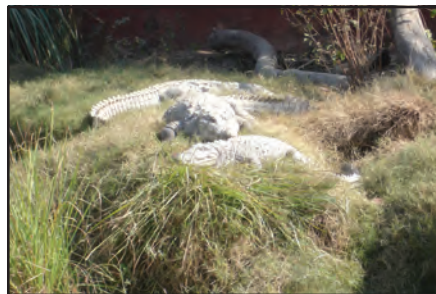
Fig. 8.12 : Crocodiles