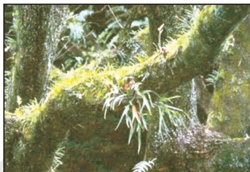
Fig. 8.3 : The Amazon Forest

As it rains heavily in this region, thick forests grow (Fig. 8.3). The forests are in fact so thick that the dense “roof” created by leaves and branches does not allow the sunlight to reach the ground. The ground remains dark and damp. Only shade tolerant vegetation may grow here. Orchids, bromeliads grow as plant parasites.