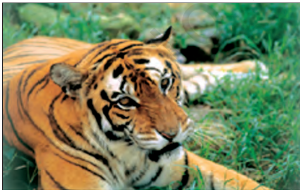
Fig. 8.14: Tiger in Manas Wildlife sanctuary

All the four ways of transport are well developed in the Ganga-Brahmaputra basin. In the plain areas the roadways and railways transport the people from one place to another. The waterways, is an effective means of transport particularly along the rivers. Kolkata is an important port on the River Hooghly. The plain area also has a large number of airports.