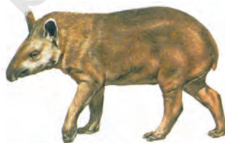
Fig. 8.5 : Tapir

Various species of reptiles and snakes also thrive in these jungles. Crocodiles, snakes, pythons abound. Anaconda and boa constrictor are some of the species. Besides, the basin is home to thousands of species of insects. Several species of fishes including the flesh-eating Piranha fish is also found in the river. This basin is thus extraordinarily rich in the variety of life found there.