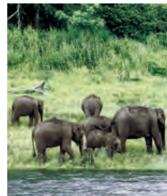
Fig. 6.8: Elephants