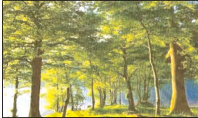
Fig. 6.11: A Temperate Deciduous Forest

As we go towards higher latitudes, there are more temperate deciduous forests (Fig. 6.11). These are found in the north eastern part of USA, China, New Zealand, Chile and also found in the coastal regions of Western Europe. They shed their leaves in the dry season. The common trees are oak, ash, beech, etc. Deer, foxes, wolves are the animals commonly found. Birds like pheasants, monals are also found here (Fig. 6.9 and 6.10).