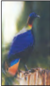
Fig. 6.10: A Monal