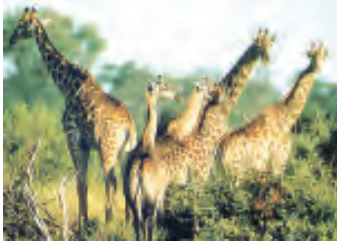
Fig. 6.15: Giraffes