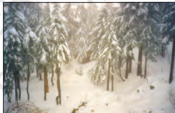
Fig. 6.13 (b): Snow covered Coniferous Forest