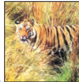
Fig. 6.5: A Tiger