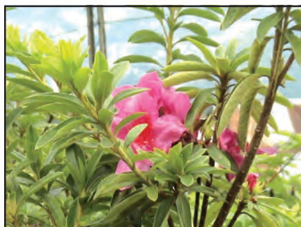
Fig. 6.1: Rhododendron

Salima was excited about the summer camp she was attending. She had gone to visit Manali in Himachal Pradesh along with her class mates. She recalled how surprised she was to see the changes in the landform and natural vegetation as the bus climbed higher and higher. The deep jungles of the foothills comprising sal and teak slowly disappeared. She could see tall trees with thin pointed leaves and cone shaped canopies on the mountain slopes. She learnt that those were coniferous trees. She noticed blooms of bright flowers on tall trees. These were the rhododendrons. From Manali as she was travelling up to Rohtang pass she saw that the land was covered with short grass and snow in some places.