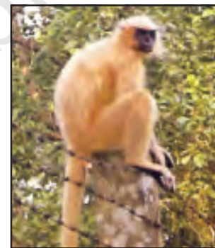
Fig. 6.6: A Golden Langoor