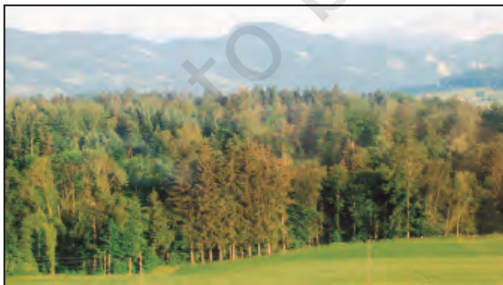
Fig. 6.7: A Temperate Evergreen Forest

The temperate evergreen forests are located in the mid-latitude coastal region (Fig. 6.7). They are commonly found along the eastern margin of the continents, e.g., in south east USA, South China and in South East Brazil. They comprise both hard and soft wood trees like oak, pine, eucalyptus, etc.