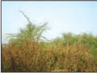
Fig. 6.2: Thorny shrubs