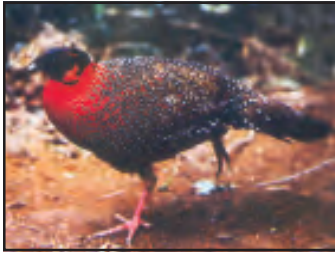
Fig. 6.9: A Pheasant