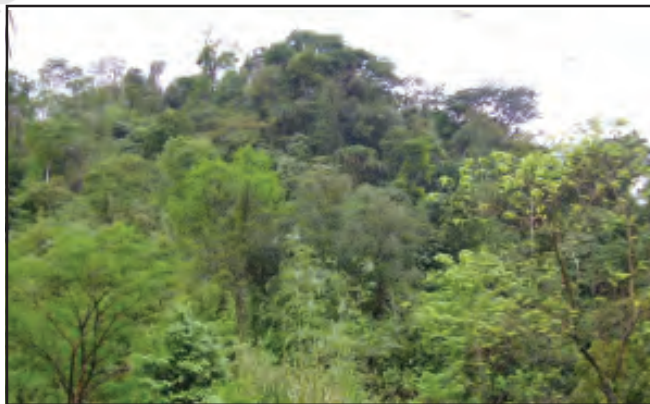
Fig. 6.3: A Tropical Evergreen Forest

Anaconda, one of the world's largest snakes is found in the tropical rainforest. It can kill and eat a large animal such as a crocodile.