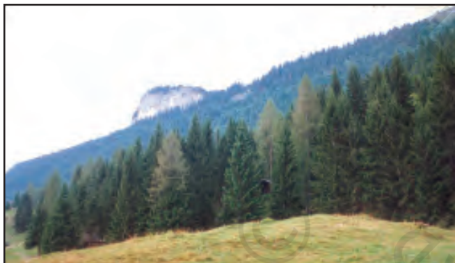
Fig. 6.13 (a): A Coniferous Forest

Taiga means pure or untouched in the Russian language