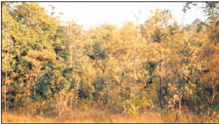
Fig. 6.4: A Tropical Deciduous Forest

Tropical deciduous are the monsoon forests found in the large part of India, northern Australia and in central America (Fig. 6.4). These regions experience seasonal changes. Trees shed their leaves in the dry season to conserve water. The hardwood trees found in these forests are sal, teak, neem and shisham. Hardwood trees are extremely useful for making furniture, transport and constructional materials. Tigers, lions, elephants, langoors and monkeys are the common animals of these regions (Fig. 6.5, 6.6 and 6.8).