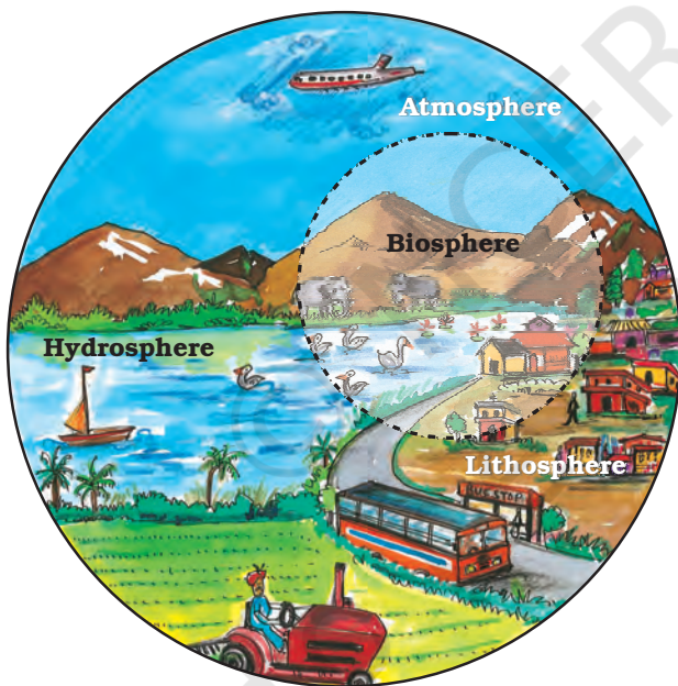
Fig. 1.2: Domains of the Environment

Lithosphere is the domain that provides us forests, grasslands for grazing, land for agriculture and human settlements. It is also a source of mineral wealth.