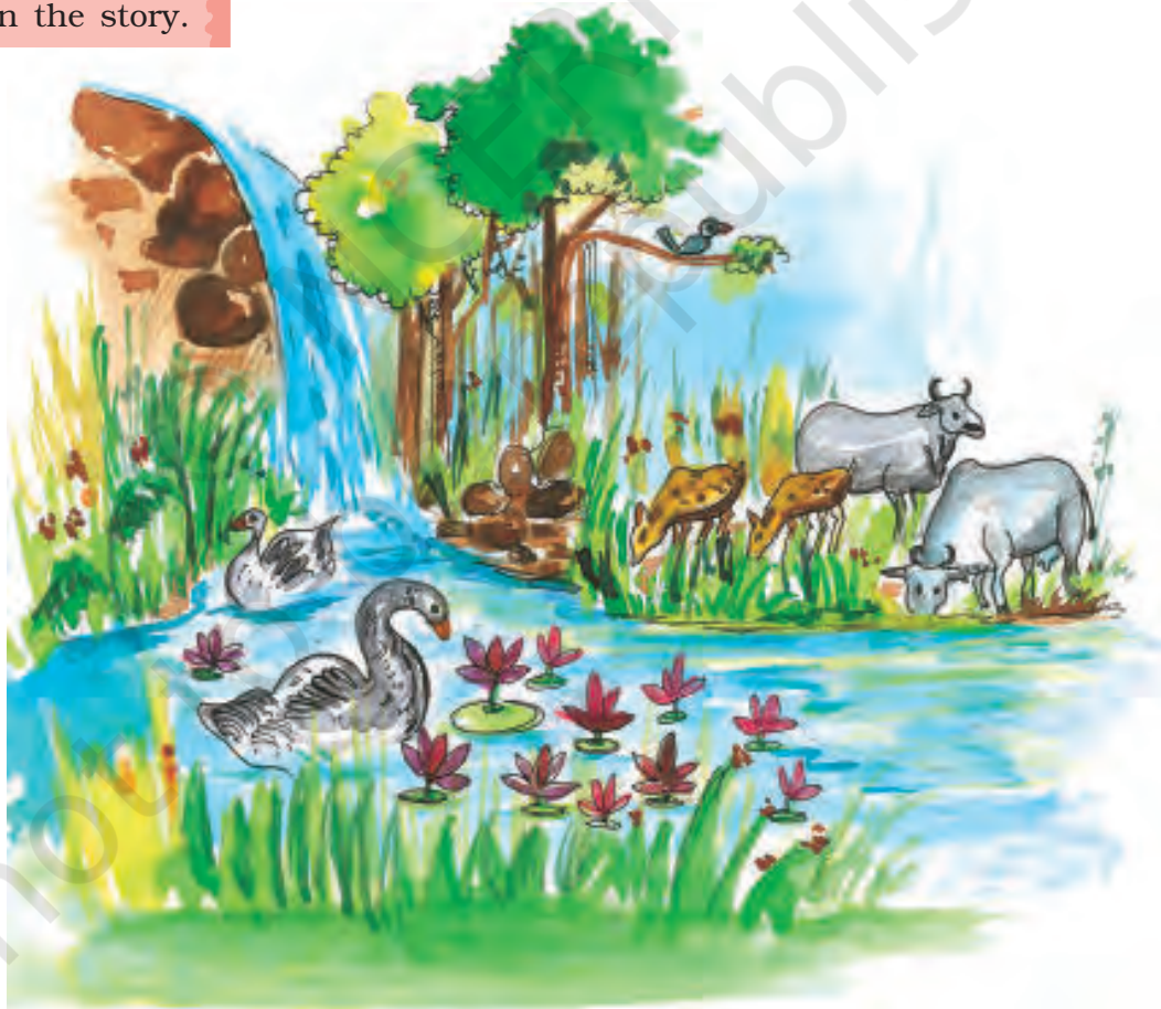
Fig. 1.3: A Pond Ecosystem