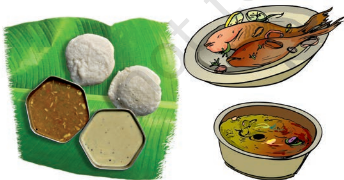
Fig. 1.1 Different food items

There seems to be so much variety in the food that we eat (Fig 1.1). What are these food items made of?