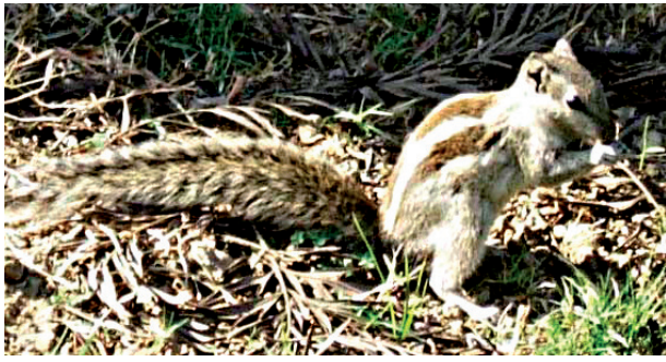
Fig. 1.8 Squirrel eating nuts

You will then surely be aware of the food, the animal eats. What about other animals? Have you ever observed what a squirrel (Fig 1.8), pigeon, lizard or a small insect may be eating as their food?