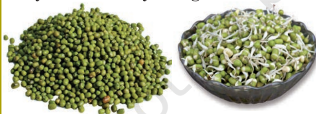
Fig. 1.5 Whole moong and its sprouts

Take some dry seeds of moong or chana . Put a small quantity of seeds in a container filled with water and leave this aside for a day. Next day, drain the water completely and leave the seeds in the vessel. Wrap them with a piece of wet cloth and set aside. The following day, do you observe any changes in the seeds?