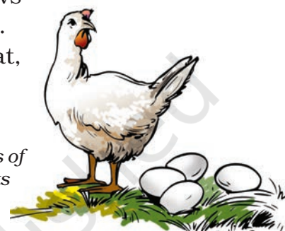
(b) Animal sources