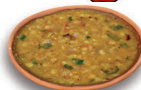
(a) Plant sources