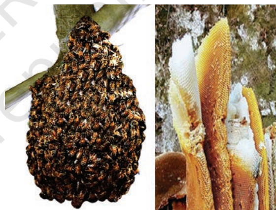
Fig. 1.7 Beehive

Do you know where honey comes from, or how it is produced? Have you seen a beehive where so many bees keep buzzing about? Bees collect nectar (sweet juices) from flowers, convert it