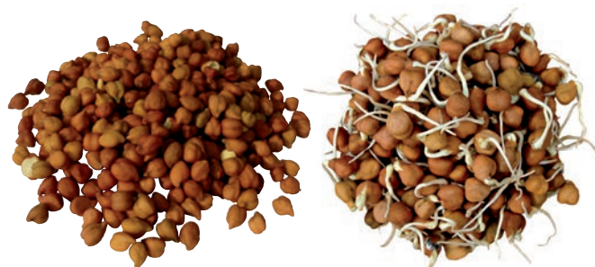
Fig. 1.6 Chana ( gram ) and its sprouts

A small white structure may have grown out of the seeds. If so, the seeds have sprouted (Fig. 1.5 and 1.6). If not, wash the seeds in water, drain the water and leave them aside for another day,