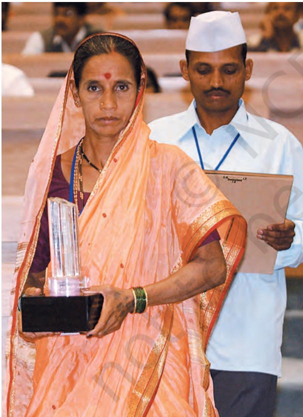
Two village Panchs from Maharashtra who were awarded the Nirmal Gram Puruskar in 2005 for the excellent work done by them in the Panchayat.

In some states, Gram Sabhas form committees like construction and development committees. These committees include some members of the Gram Sabha and some from the Gram Panchayat who work together to carry out specific tasks.