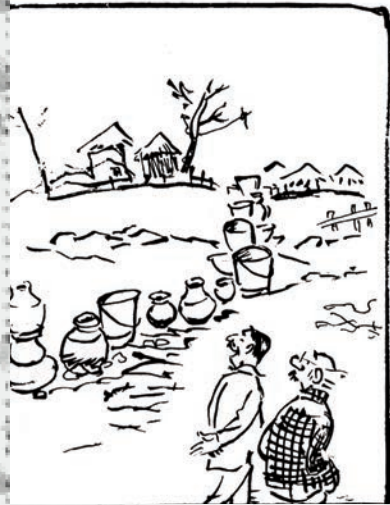
Not bad! One of the taps in the nearby village must be getting water!