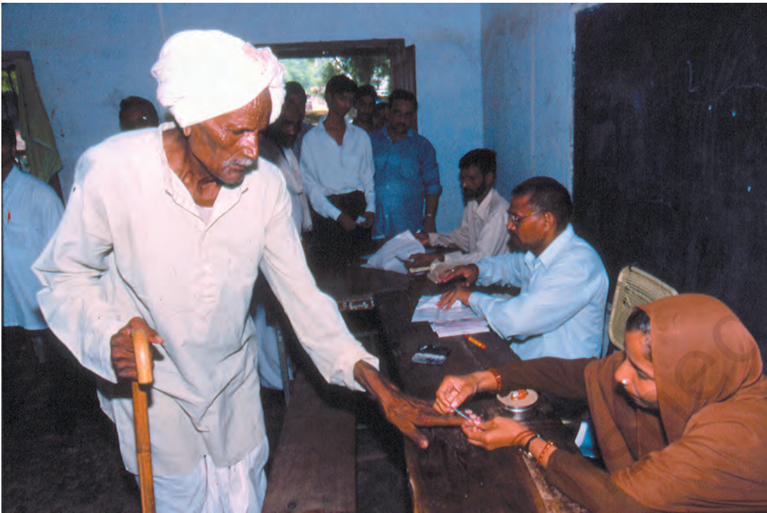
Voting in a rural area: A mark is put on the finger to make sure that a person casts only one vote.

decisions for the entire population. These days a government cannot call itself democratic unless it allows what is known as universal adult franchise. This means that all adults in the country are allowed to vote.