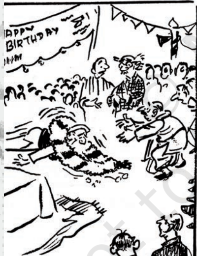
I told him to make the garland smaller... He is a frail old man and wouldn't be able to stand the weight of such a huge garland!