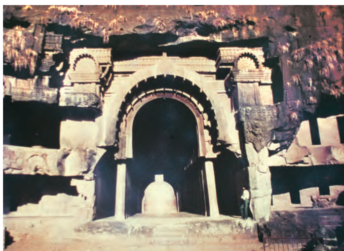
A cave at Karle, Maharashtra

Read page 100 once more. Can you think of how Buddhism spread to these lands?