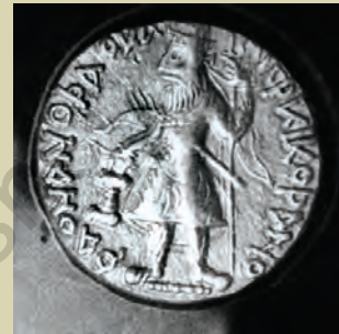
A Kushana coin

In the north, and in parts of central India, a general of the Mauryas, named Pushyamitra Shunga, set up a kingdom. The Shungas were followed by another dynasty, known as the Kanvas, and by rulers from other families till the establishment of the Gupta empire about 1700 years ago.