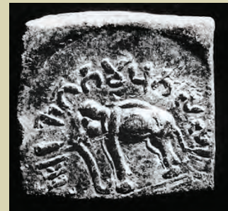
A Satavahana coin

There were other changes that were taking place, in which ordinary men and women played a major role. These included the spread of agriculture and the growth of new towns, craft production and trade. Traders explored land routes within the subcontinent and outside, and sea routes to West Asia, East Africa and South East Asia (see Map 6) were also opened up. And many new buildings were built — including the earliest temples and stupas , books were written, and scientific discoveries were made. These developments took place simultaneously , i.e. at the same time. Keep this in mind as you read the rest of the book.