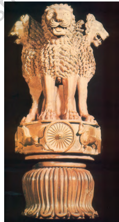
The lion capital

The empire that Ashoka ruled was founded by his grandfather, Chandragupta Maurya, more than 2300 years ago. Chandragupta was supported by a wise man named Chanakya or Kautilya. Many of Chanakya's ideas were written down in a book called the Arthashastra.