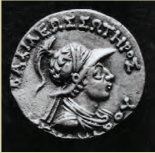
An Indo-Greek coin

The Mauryan empire collapsed about 2200 years ago. In its place (and elsewhere) rose several new kingdoms. In the north-west, and in parts of north India, kings known as the Indo-Greeks ruled for about one hundred years. They were followed