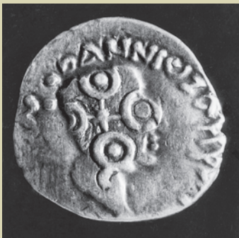
A Shaka coin

The Shakas who ruled over parts of western India fought several battles with the Satavahanas, who ruled over western and parts of central India. The Satavahana kingdom, which was established about 2100 years ago, lasted for about 400 years. Around 1700 years ago, a new ruling family, known as the Vakatakas, became powerful in central and western India.