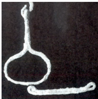
Iron equipment found from megalithic burials.