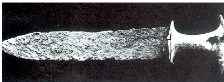
Below : A dagger.