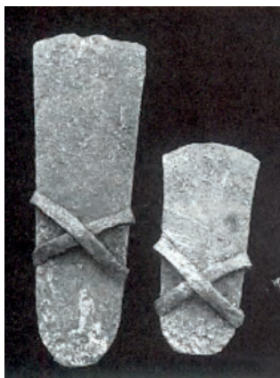
Left below : Axes.