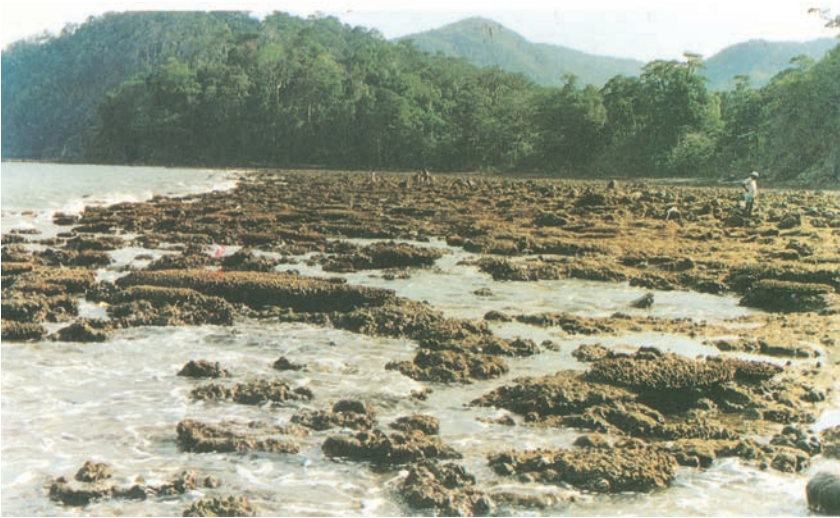
Figure 7.4 : Coral Islands